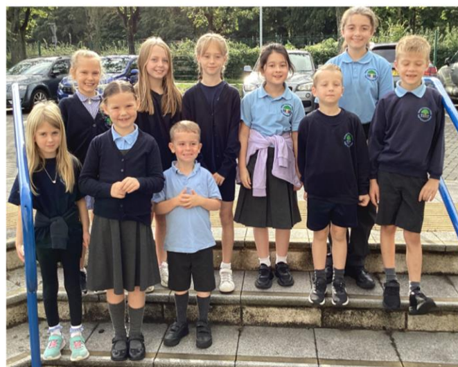
Dancing and Football Success