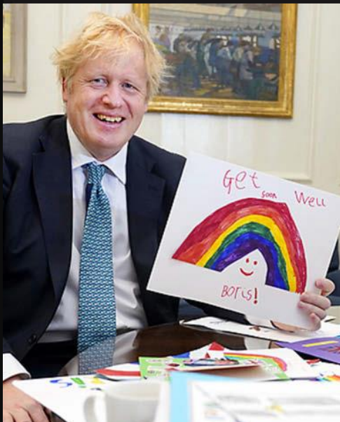
SUPERHERO: PM holds his welcome greeting

BORIS JOHNSON has written a letter of thanks to a six-year-old boy who sent him a picture of a rainbow when he was battling coronavirus.